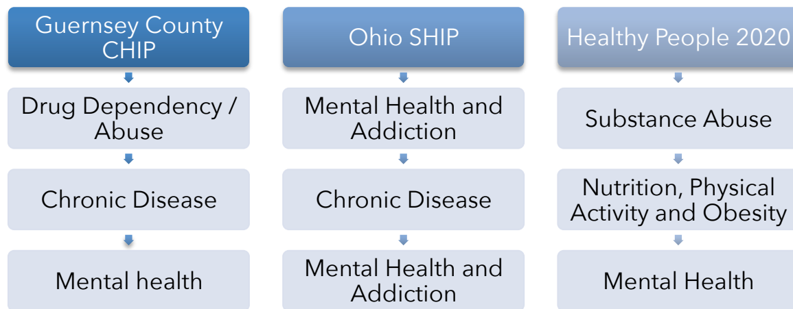
Figure 2: Guernsey County CHIP, Ohio SHIP, And National Priority Alignment

As shown in Figure 2, the health priorities identified by the Guernsey County community align well with both state and national priority areas.