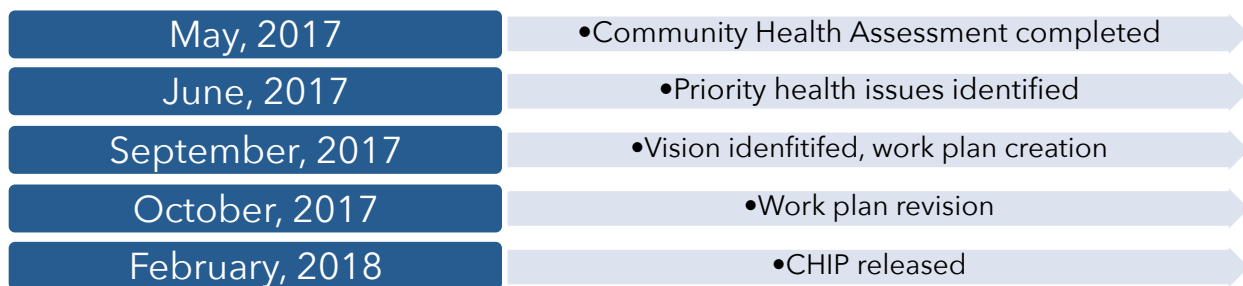
Figure 1: CHIP Timeline

The GCHD was responsible for providing oversight and financial support for the CHIP development process. The GCHD contracted with Illuminology and The Ohio State University's Center for Public Health Practice to design the CHIP process, to facilitate multiple group meetings, to provide technical counsel, and to draft this document.