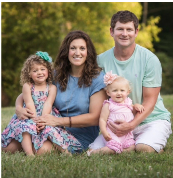
The Riggle Family, Immunization clients