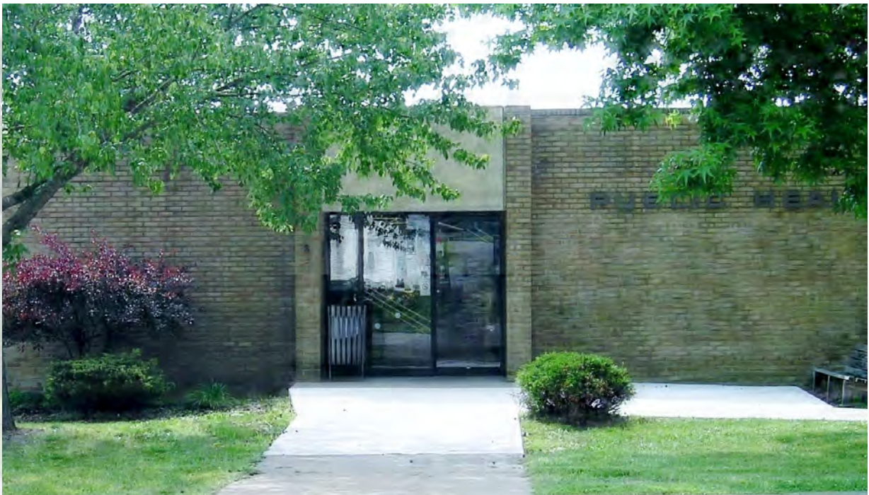
The Cambridge-Guernsey County Health Department is located on 326 Highland Avenue in Cambridge, Ohio. The health department is open Monday 8 A.M. to 5:30 P.M., and Tuesday through Friday 8 A.M. to 4:30 P.M.

The Board of Health is the governing body of the Cambridge-Guernsey County Health Department. The District Advisory Council appoints three (3) members to the Board of Health and the Mayor of the City of Cambridge appoints the other two (2) members. The District Advisory Council consists of the chairman of the Board of Trustees from each township, the mayor from each village and a representative of the Board of County Commissioners.