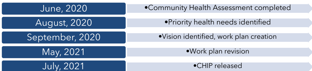
Figure 1: CHIP Timeline

The GCHD was responsible for providing oversight and financial support for the CHIP development process. The GCHD contracted with Illuminology and The Ohio State University's Center for Public Health Practice to design the CHIP process, to facilitate multiple group meetings, to provide technical counsel, and to draft this document.