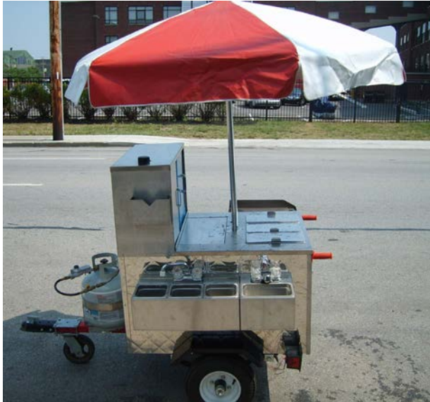
An example of a pushcart with a three compartment sink and a handsink.