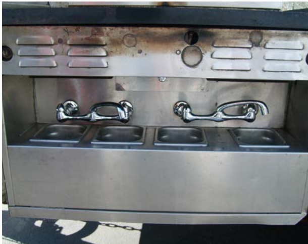
An example of a three compartment sink and a handsink on a pushcart.